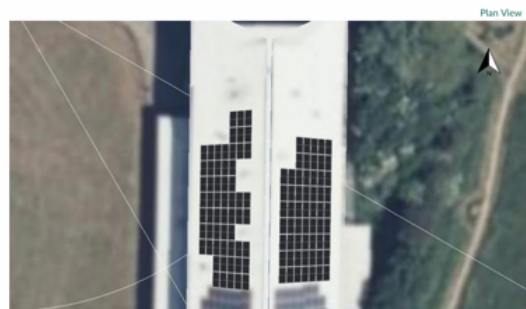
One Leisure Huntingdon (Dryside)