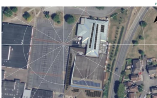
One Leisure St Neots