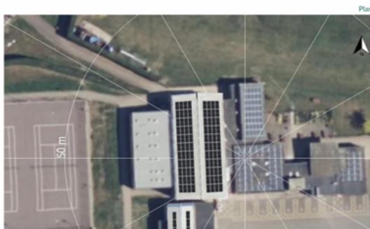
One Leisure St Ives Outdoor